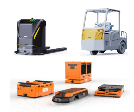
Transport Mobile Robot