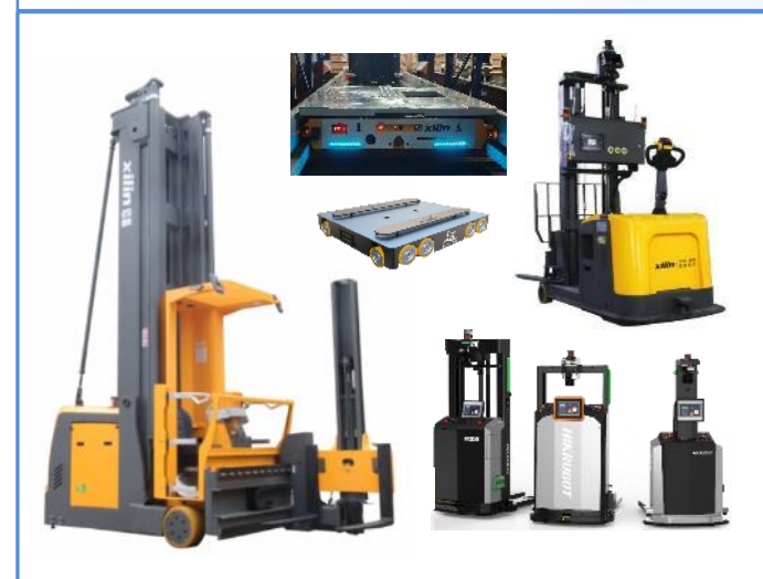
Forklift Mobile Robot