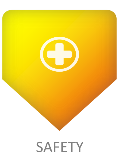
No Maintenance Easy to operate Ergonomic design