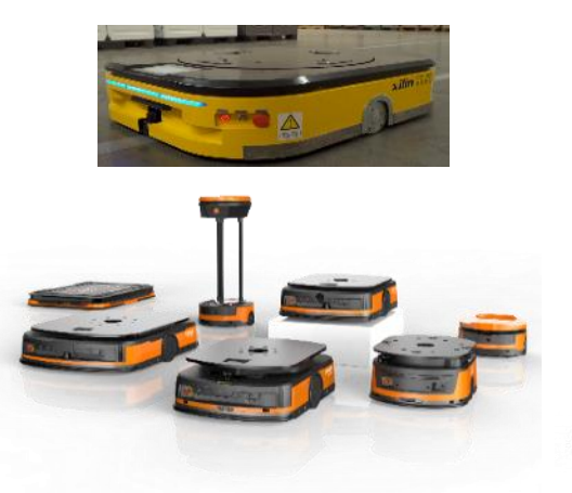
Latent/SR Mobile Robot